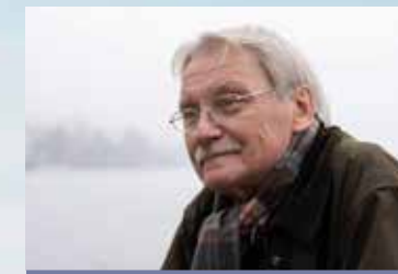
— ROLAND AMBASSADOR, GERMANY

After the consultation I went straight to my father's house and we hugged each other very tightly. I told him, “Dad, Mum has gone but the illness hasn't. I'm the patient now and it's time to take care of myself.”