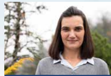
— CATILENA AMBASSADOR, SPAIN

“Coming to terms with this disease is not easy. In fact, I always say that I haven't accepted this disease but instead have learned to live with it. Fortunately, I had a great example in my mother. She taught me three of the most important things when it comes to living with this condition. First, to smile and to share your smile with others. Second, to always pack a survival kit with your essentials, like spare clothes and medication. And third, to enjoy every possible moment, especially the simple things, such as waking up each morning feeling grateful to be alive.”