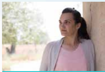
— CATILENA AMBASSADOR, SPAIN

“My wish is for a greater understanding of this disease. It feels as if so many health professionals aren't familiar with it, but the quicker people can receive a diagnosis, the quicker they can receive treatment. I'm provided with great comfort and hope when I see the current research and treatment efforts. Now, I feel the future is much brighter for not only my biological family but my entire amyloidosis family, as well.”