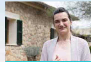
— CATILENA AMBASSADOR, SPAIN

I tried to protect my mother and I told her only when I knew I was being treated. I was certain it would be a shock for her, to think that she would repeat the experience she had lived through with her husband, with her son. When I told her the news, it was a shock for her, it was difficult, but she became really invested to support me.”